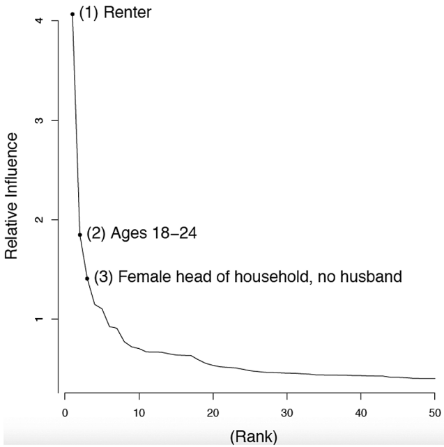
Figure 1. Relative Influence of the 50 Most Influential Variables in the Winning Challenge Model.

may be included with both versions of the PDB. Because we want to predict areas that are hard to enumerate, we used 100 minus return rate—“non-return rate”—as the dependent variable. Most predictors are highly significant at both levels of geography, and all are significant at at least one level of geography. Seven of the twelve variables from the original HTC score are found in the model. 6 Other variables include length of residence, presence of young children, and married-couple households—variables that describe the “place attachment” construct found in urban sociology literature (Brown, Perkins, and Brown 2003). This construct figures into theories explaining behaviors such as level of civic engagement, voting, and even participation in surveys (Guterbock, Hubbard, and Hoilan 2006). From table 1, we see that (given all other covariates) the presence of renters, vacant units, and persons aged 18–24 in a block group are all positively associated with low response. That is, the greater the presence of these characteristics in a block group, the lower the self-response rates. Alternatively, presence of persons aged 65+, married couples, and persons with a college degree are negatively associated with low response.